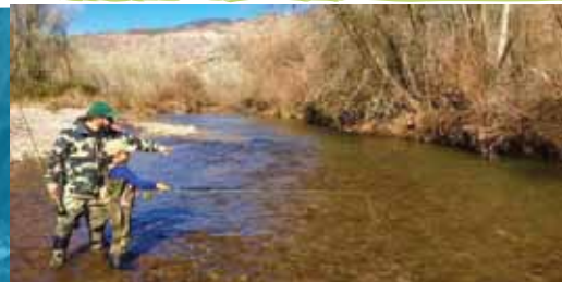
Fourteen native fishes live in the basin, including four that occur nowhere else in the world. The area is prized for its wildlife habitat and hunting opportunities, including world class elk, mule deer, Coues deer and wild turkey.

DEVELOPMENT PRESSURES COULD CHANGE the GILA forever