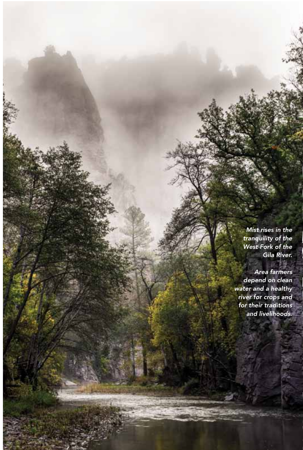
Mist rises in the tranquility of the West Fork of the Gila River.